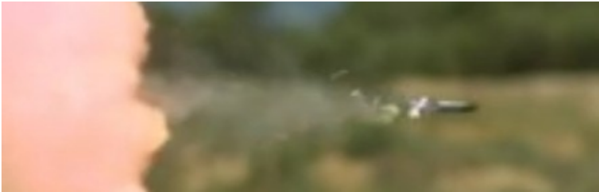
Paper patch "confetti".

A good PPB cartridge should chamber easily. There should be no need to force the cartridge into the barrel's chamber. After ignition, as the wrapped slick exits the muzzle, the patching paper should get sliced by the rifling and spin off as confetti.